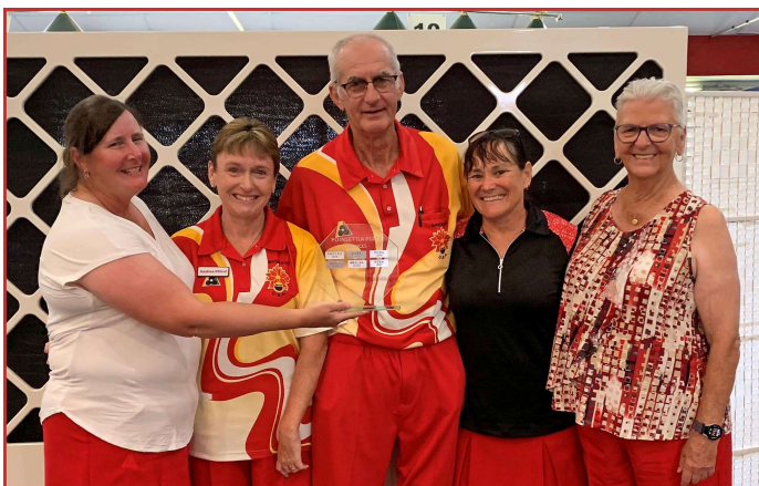
2023 Moreton Bay Challenge Novice Shield Match Winners - B.D.B.A. Ladies Novice Team played at Bramble Bay Bowls Club on 5th March 2023